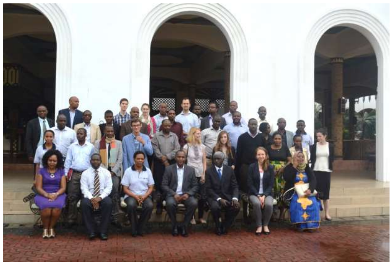
A group photo of participants at the conference

An action plan was prepared for kick-off and putting the hub into operation. The plan included Preparation of conference report; Creation of mailing list; Preparation of feedback meetings at country level and Appointment of country contact person; Sharing of feedback from the meetings and name of the country contact person; and holding another conference for operationalization of the hub. Also, suggested were made to rotate such conferences in each of the five East African countries. Moreover, at a later stage – members will jointly prepare and implement climate change adaptation programs within the region.