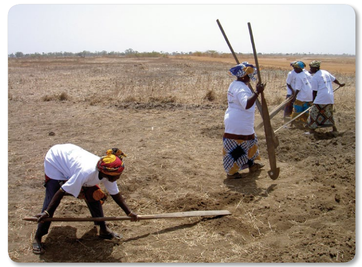
Joal's Women showing paddy field degradated by salinization.

For instance, the way how the stakeholder consultations have taken place is more transparent than the other projects, because the proposal not only mentions the numbers of consultations made, but also explicitly indicates in the proposal which inputs arose from which communities and associations. Furthermore, the list of all relevant decisions taken and persons involved are publicly available. While the other submitted projects (even the one other approved proposal of Honduras) rely on government agencies (mostly environment ministries as executing entities (EE), in the case of Honduras the "national" Secretariat Environment and Natural Resources (SERNA)), the execution of the project in Senegal will be undertaken through different organisations with diverse backgrounds. The different chosen EEs (the Department of Environment and Classified Institutions (DEEC) under the authority of the environment ministry, the NGO Green Senegal, an Association of youth and women) will closely work with the local communities, which will undertake several tasks in the execution of the project depending on their capacities.