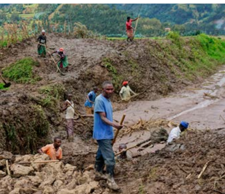
Photo: Adaptation Fund project site in Rwanda.

→ The AF NGO Network wants to see more such best practices!