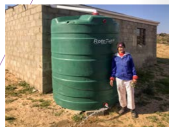
The Small Grants Facility in South Africa has pioneered enhanced direct access to the Adaptation Fund. This woman now has a rainwater-harvesting facility installed at her house which helps her to cope with the increased water scarcity in dry seasons.

→ The AF NGO Network wants to see more such best practices!