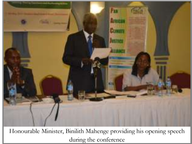
Honourable Minister, Binilith Mahenge providing his opening speech during the conference

Honourable Binilith Mahenge (Minister of State – Environment): he started by welcoming all participants to the conference and Tanzania for those who were coming outside Tanzania. He then congratulated the organizers for holding such important conference and acknowledged ForumCC work on climate change issues in Tanzania and beyond. He then highlighted impacts of climate change and some of the major initiatives undertaken at East Africa. He explained that despite such initiatives East African countries are still faced with challenges of capacity both technical and financial. He acknowledged civil societies' role in addressing climate change and called for strengthening their capacity and coordination. He concluded by telling participants that the government is ready and willing to listen and support CSOs initiatives at the region.