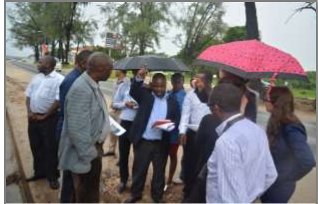
Dar es Salaam City Engineer explaining about the sea wall along Obama Avenue to a section of Conference participants

During the visit, participants witness on first-hand the effects of climate change including damage of the sea wall and mangroves along the Indian Ocean coast. This provided opportunity for them to understand about both hard and soft adaptation measures which were the sea wall and mangroves rehabilitation respectively.